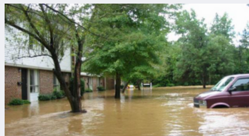
In any hurricane, tropical storm or three-day drenching, a handful of Raleigh spots reliably take the worst blows: Wake Forest Road near the Costco; Atlantic Avenue near Hodges Street; Crabtree Valley Mall. But the neighborhoods that hug Walnut Creek get so routinely pummeled that it's common to see muskrats swim past. On Tuesday, an owl hooted at noon.